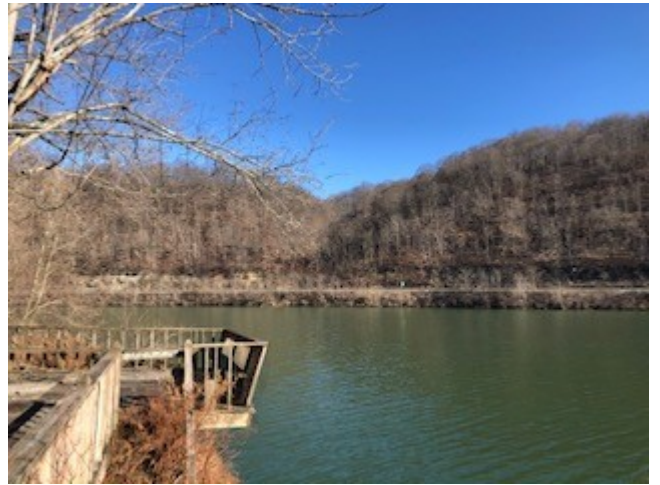
Photos of property area and a fish that was caught less than a football field length away from the property.